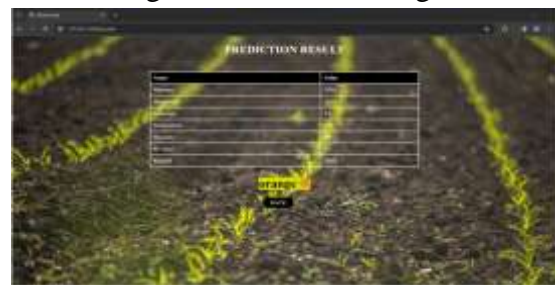
Figure 5: Crop Recommendation Result Page