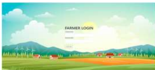
Figure 2: Login page