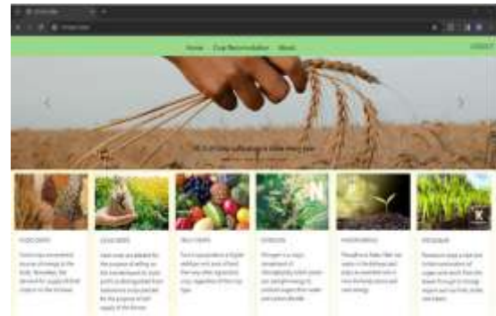
Figure 3: Home Page