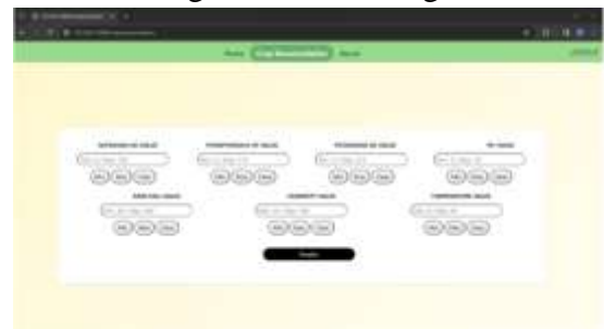
Figure 4: Prediction Page