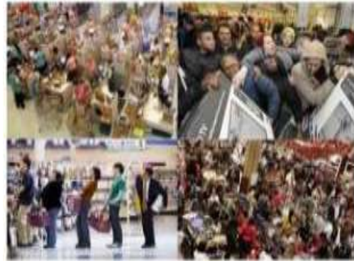
Fig.1. Something that mall shoppers must cope with.

The shopping district sees crowds of several thousand people during major events and holidays. The use of calculators to determine prices and provide receipts for items purchased in supermarkets or shopping malls was once commonplace. Because it is a lengthy operation, clients have to wait a long time to receive their invoices. Sometimes people make mistakes (Figure 1). This issue has been resolved by implementing barcode payment. Unlike the old ways, this technology gets rid of long lines and human error when pricing products. Using a sight line is key to accomplishing this. The content that the viewer examines.