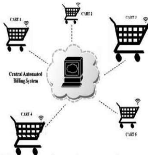
Fig. 4. Central automated billing system Data processing at the administration or cashier level is handled by a web application called the Supermarket System.