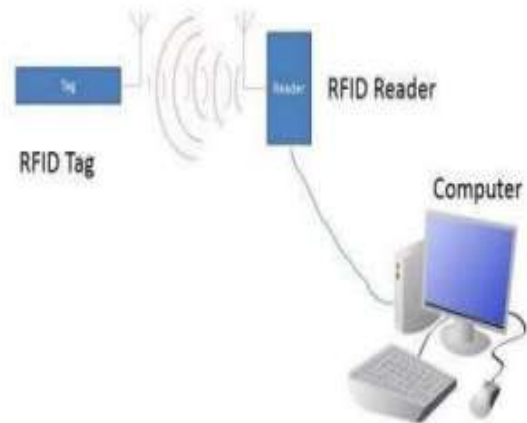
Fig.2. Working Process of RFID

are utilized. The sign doesn't need to be positioned precisely in the center of the observer's field of view for scanning. Figure 2 shows an image of a radio frequency identification reader. Through its transmitters and tags, it can communicate with others.